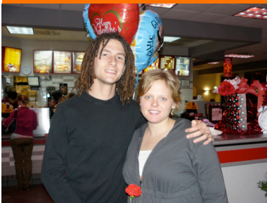
Valentines day at Chick-fil-a