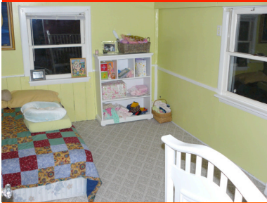
Getting the baby room ready